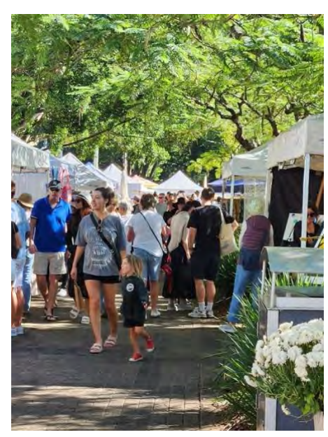
One of the many stall lanes.