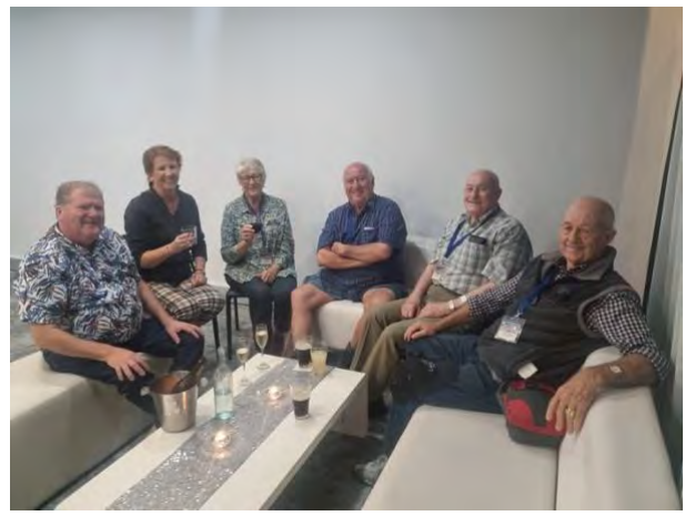
Random photos of members catching up.