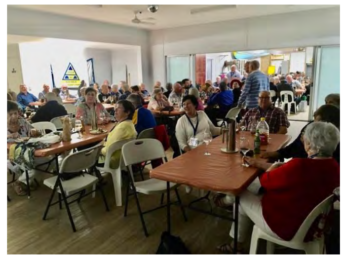
And afterwards we cleared up and packed the tables and chairs away.