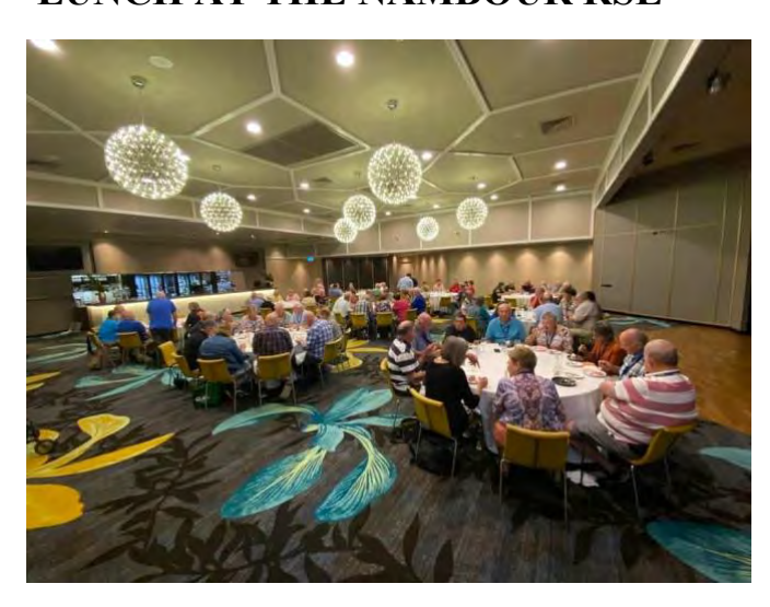
Saturday night's dinner was at the Ramada Resort.