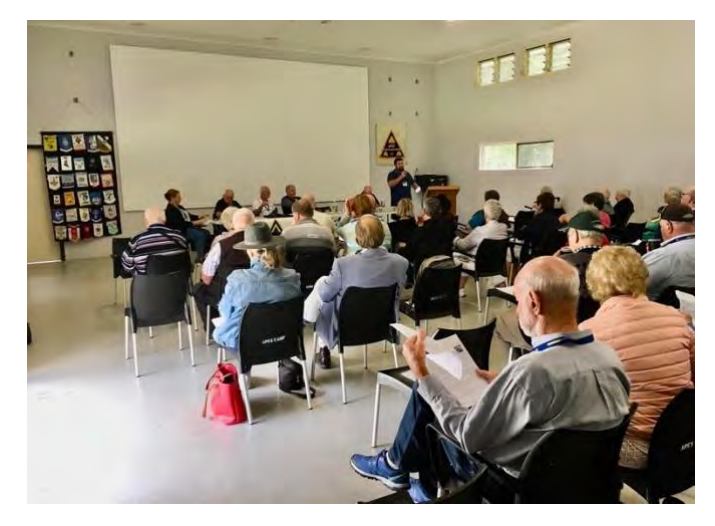
The "business" session! Our annual A.G.M.