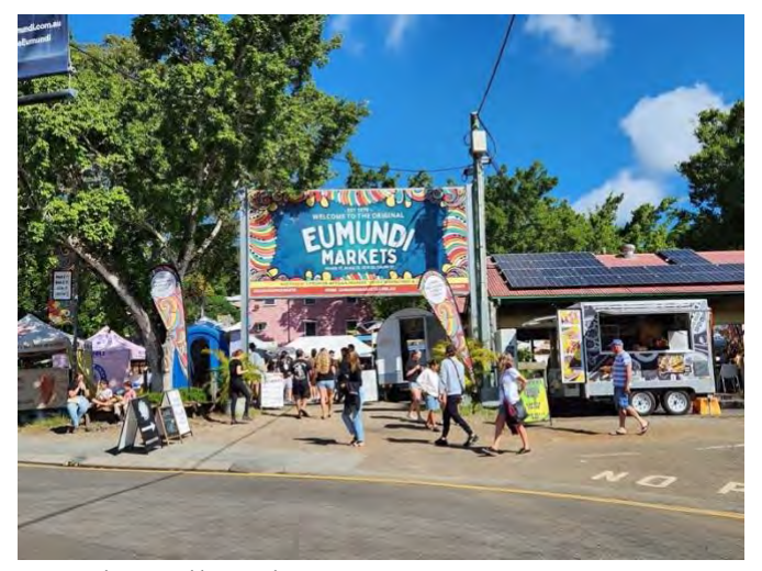
Enter here all ye shoppers!