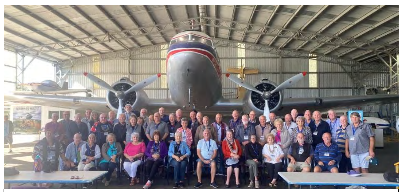
The majority of the 2024 Sunshine Coaster Rorters taken at the Caloundra Air Museum, minus a few needing additional retail therapy.

Official publication for Apex 40 Australia Inc. Apex 40 Australia Inc. is the recognized body of affiliated past Apexians groups.