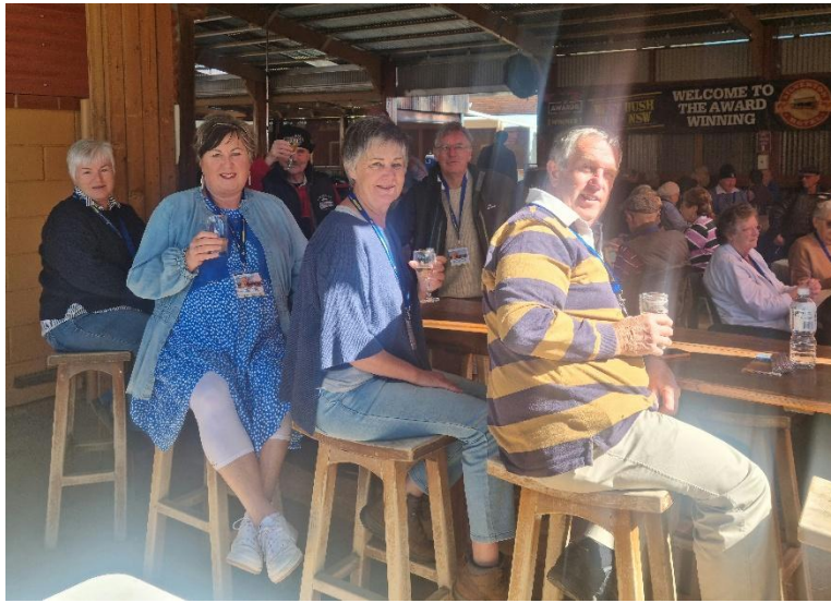
Some of the NZ contingent with Aussie friends enjoying the AGM at Silverton