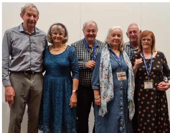
Xepa at the Rort