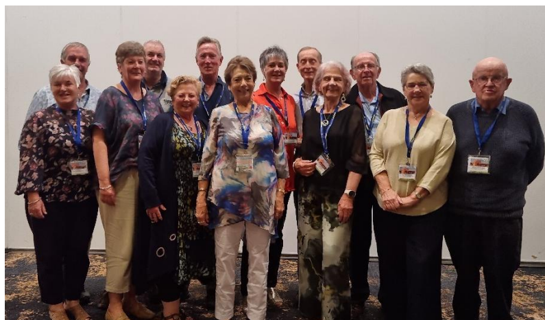
Leeton group at the Rort